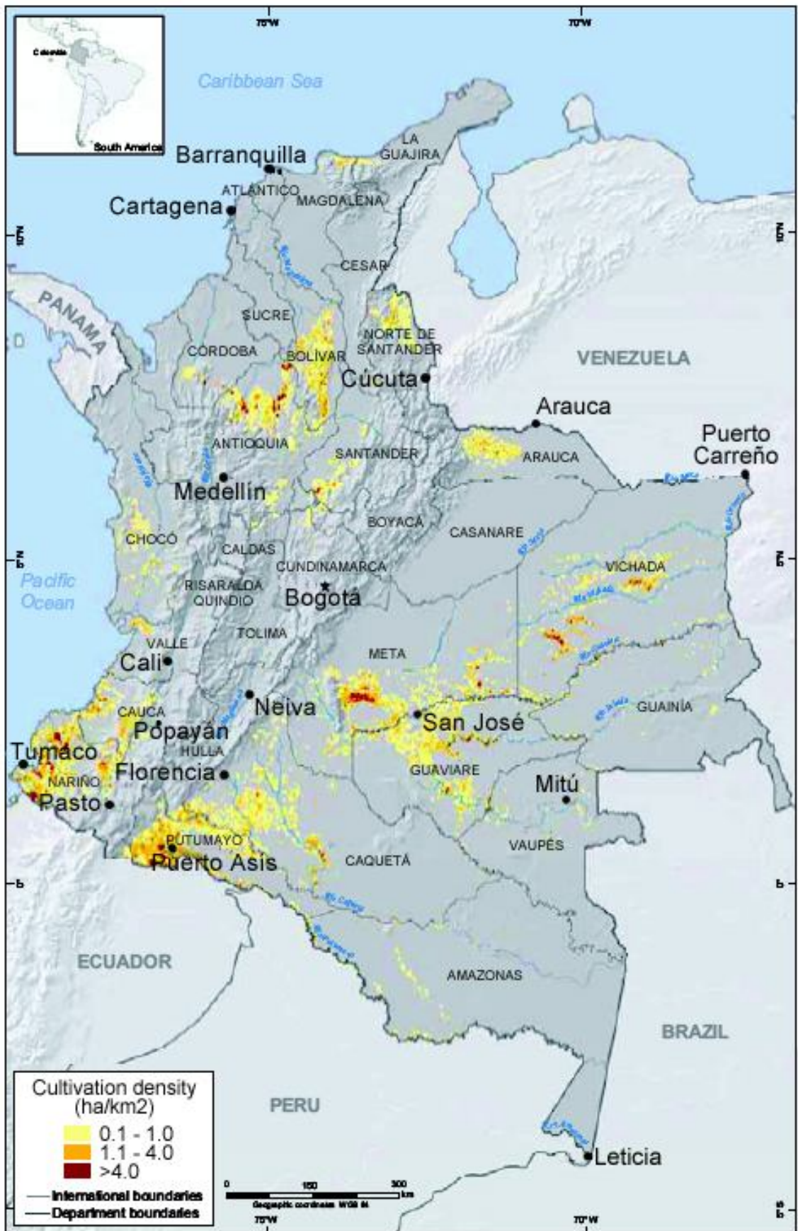
Map 2 – Coca crops in 2007 - UNODC

The boundaries and names shown, and the designations used in this map do not imply official endorsement or acceptance by the United Nations